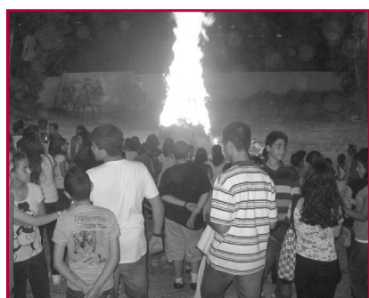
Back to school bonfire for upper school