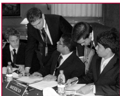
RFS participants at MUN Conference in Cairo