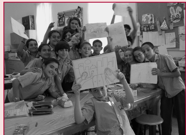
Lower school students have opportunities to enjoy reading in the library and creating original work in art class.