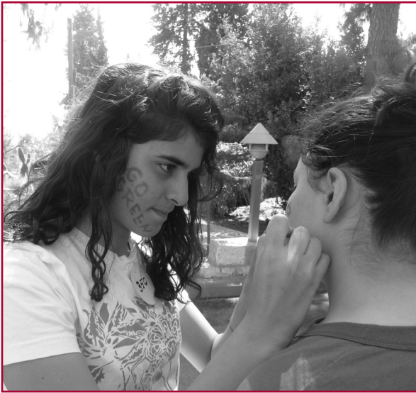
RFS students participated in activities such as face painting at the Kaykab Garden to support the initiative to cut CO 2 emissions.

E mbraced within the arms of Ramallah and El-Bireh cities lies the green, peaceful and calm Kaykab Garden, an educational garden promoting environmental awareness that is overseen by Ramallah Friends Schools (RFS). The Kaykab Garden was named after a local endangered plant species and was established in 2001, by funding from Heinrich Boll institution and direct supervision from Birzeit University, to serve as a botanical garden with over 150 plant types identified and labeled.