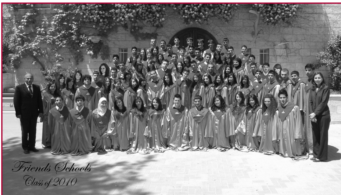
Friends Schools Class of 2010

Through an initiative aimed at saving money and resources, we have begun to shift much of our correspondence online. Donations can now be made with the click of a mouse on our new, completely secure online donation page (designed and supported by eCommerce, a U.S.-based company). Donations made through this secure site are U.S. tax-deductible; please visit our web page for other donation methods. As always, we will never share your information with a third party. Visit www.palfriends.org and click "Donate" for more information.