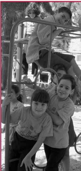
Lower school students enjoying the playground.

During the summer, a lot of renovation took place and new pieces of furniture were purchased. Teachers’ rooms were renovated and painted and a false ceiling with new lighting fixtures was installed. Additionally, new wooden lockers and shelves replaced the old ones. Also, 180 new desks and chairs were purchased for the fifth and sixth grades in addition to new cupboards. The science lab was equipped with new equipment. It is essential to mention that funds from the MSN program (Model School Network) designed by the AMIDEAST covered part of the cost and the school paid the rest.