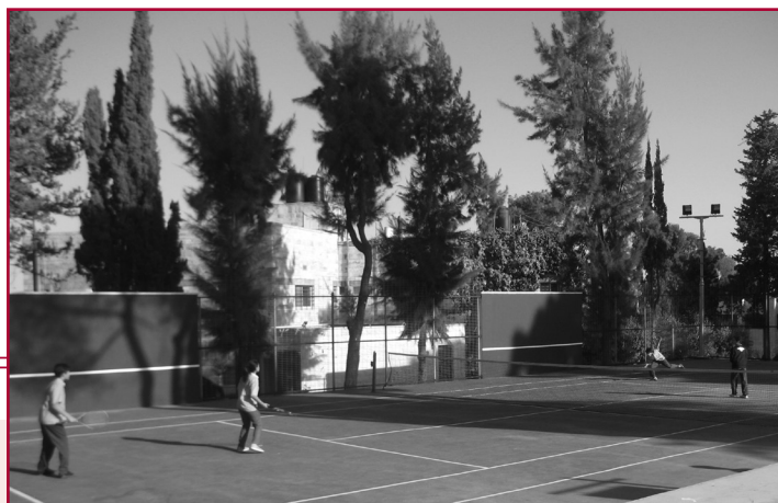
Upper school students play tennis on the newly renovated court.