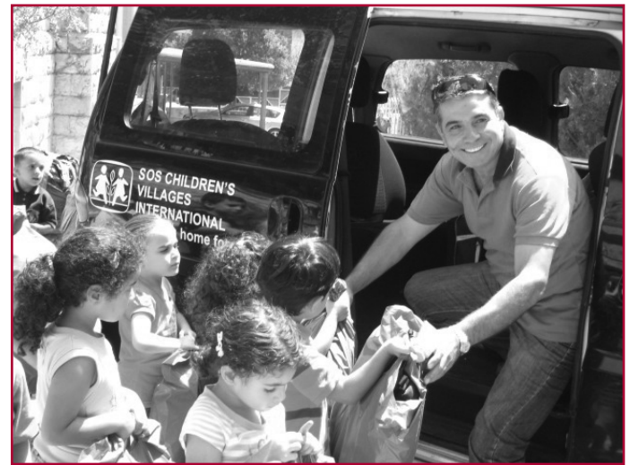
Kindergarten students give presents to an SOS village employee.

T here is nothing like starting our journey in life with giving: either emotional or material. Usually we start the school year with high doses of emotional giving for our new children and their parents as we witness their first experience with separation. The beginning of this year was additionally special. We started the school year with the fasting month of Ramadan where the spirit of giving touched everybody. As soon as we launched the campaign for helping around 135 children at the SOS village in providing them with the back to school necessities, the spirit of Ramadan brought out everyone's kindness and generosity. Parents and teachers donated money and presents in addition to some shopkeepers who made considerable discounts knowing that all this is for a good cause. Our entire school community was more than willing and happy to participate in this event and make it work. Further plans were arranged to keep this initiative going through mutual visits between our kindergarten and the SOS village and by making it a tradition to always start the school year in the same way. It keeps coming to my mind how the beginning of this year started and continues to bring out the best in all of us. 🌸